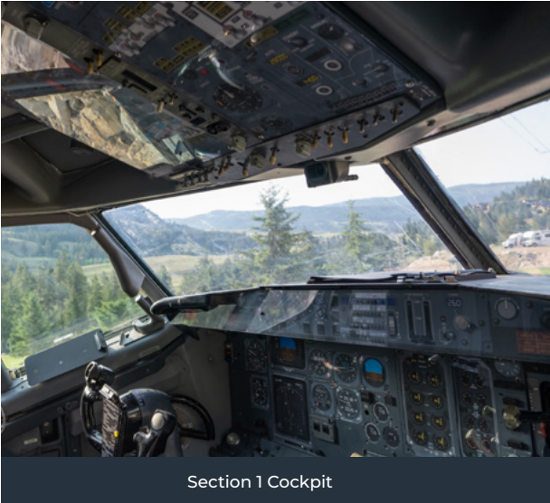
Section 1 Cockpit

Weighing 8,000lbs – 30' long x 12.5' wide x 10' tall (from bottom of steel structure to top of fuselage)