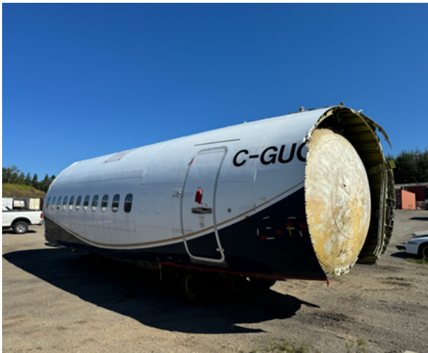
Section 3 Exterior

Weighing 7,000lbs – 30' long x 12.5' wide x 10' tall (from bottom of steel structure to top of fuselage)