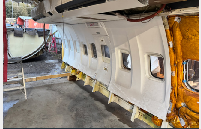
Section 2 Interior