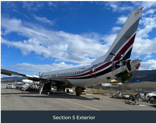
Section 5 Exterior

Weighing 11,000lbs – 41' long x 12.5' wide x 13.5' tall