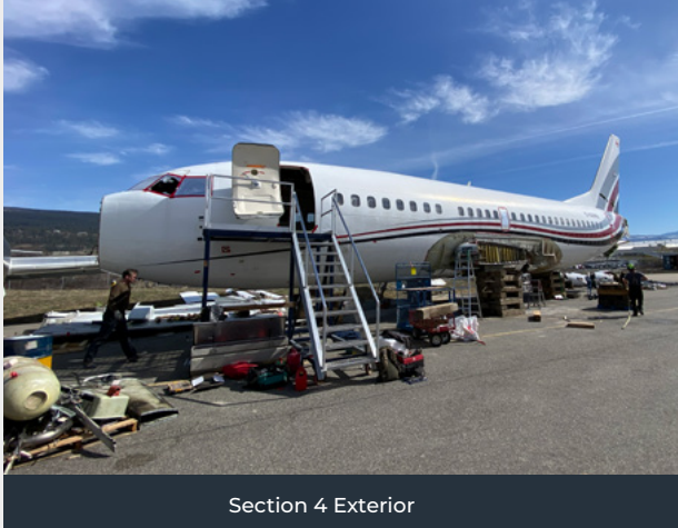
Section 4 Exterior

Weighing 16,000lbs – 50' long x 12.5' wide x 13.5' tall