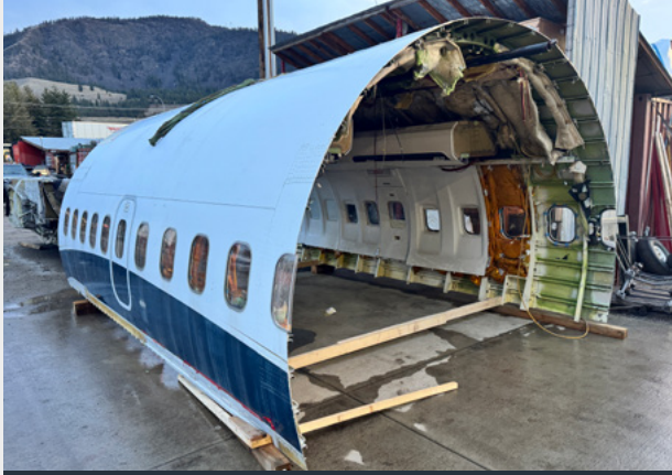
Section 2 Exterior

Weighing 8,000lbs – 20' long x 12.5' wide x 13.5' tall