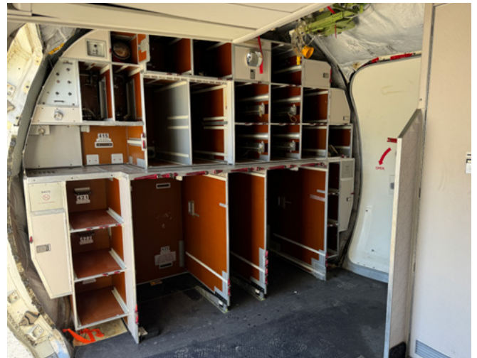
Section 3 Galley