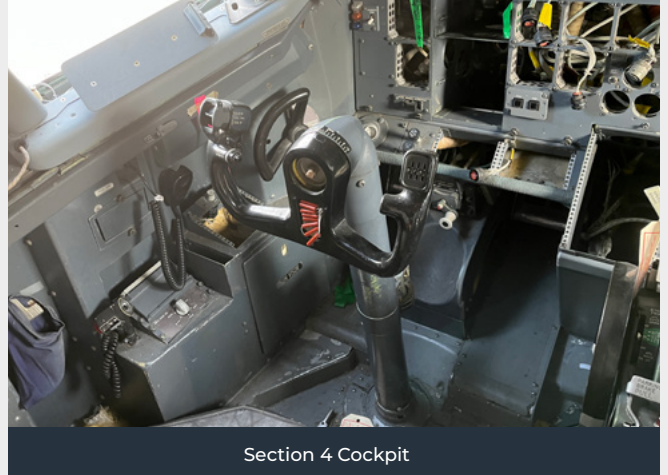
Section 4 Cockpit